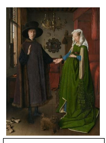
"The Arnolfini Portrait"