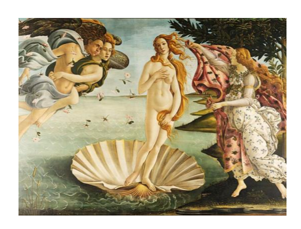
"The Birth of Venus"