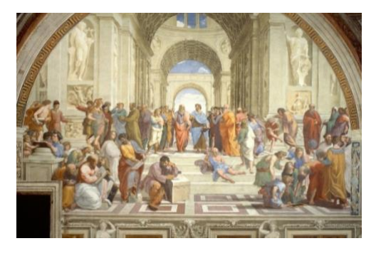
"The School of Athens"