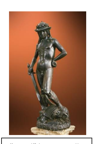
"David" by Donatello